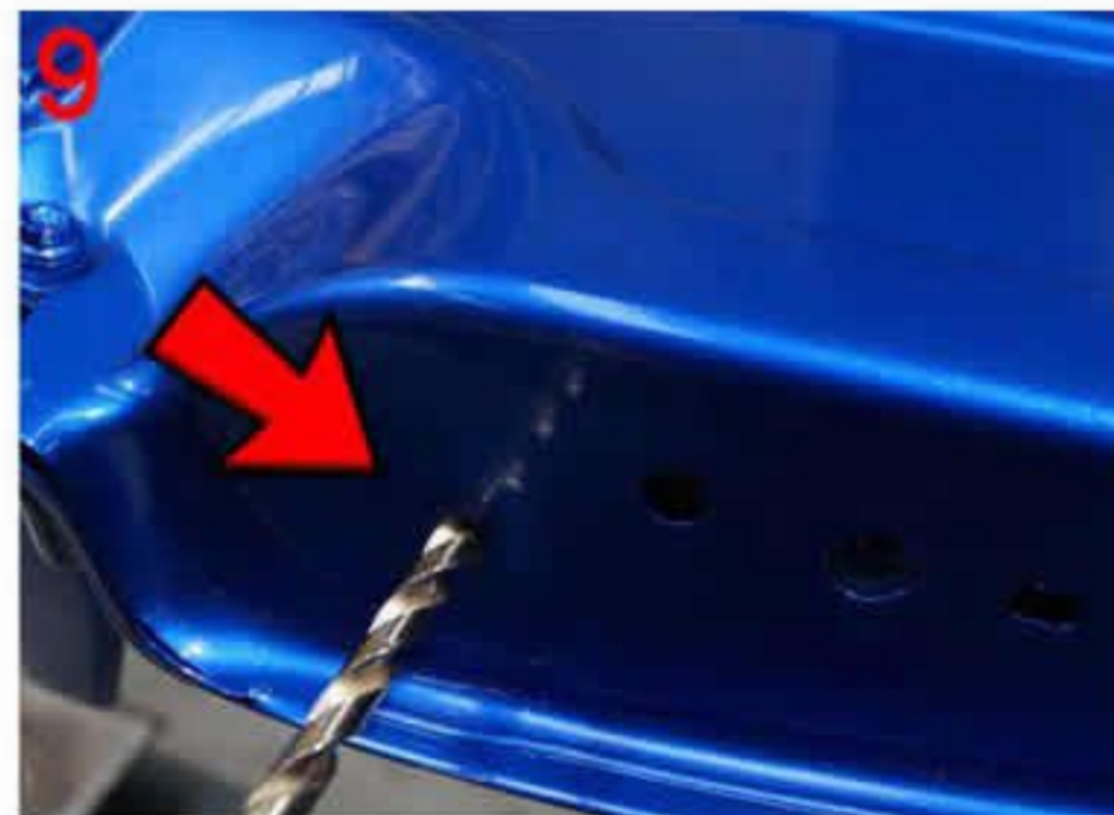
9: Drill the tailgate on the mark you just made Tip: drill a small hole first then drill to 9mm