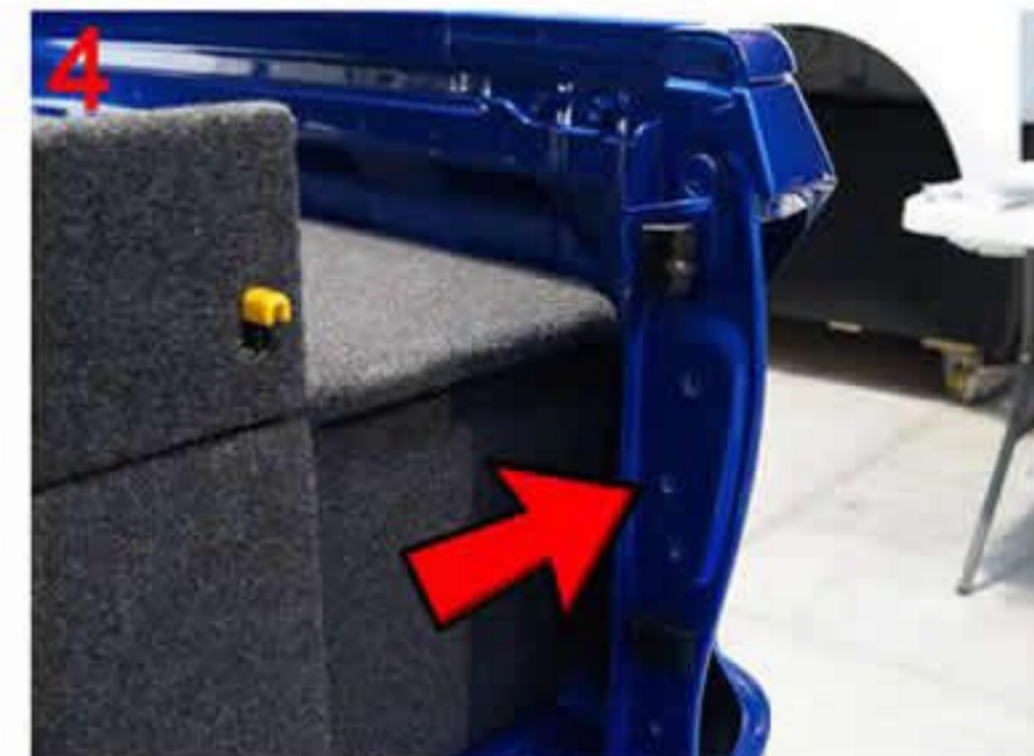
4: Factory hole that the DOWN strut mounts to