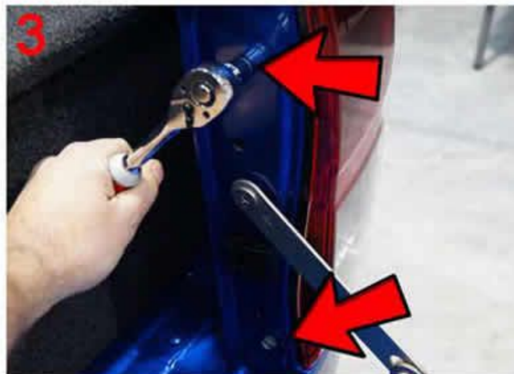
3: Remove the two tail light bolts followed by the light assembly