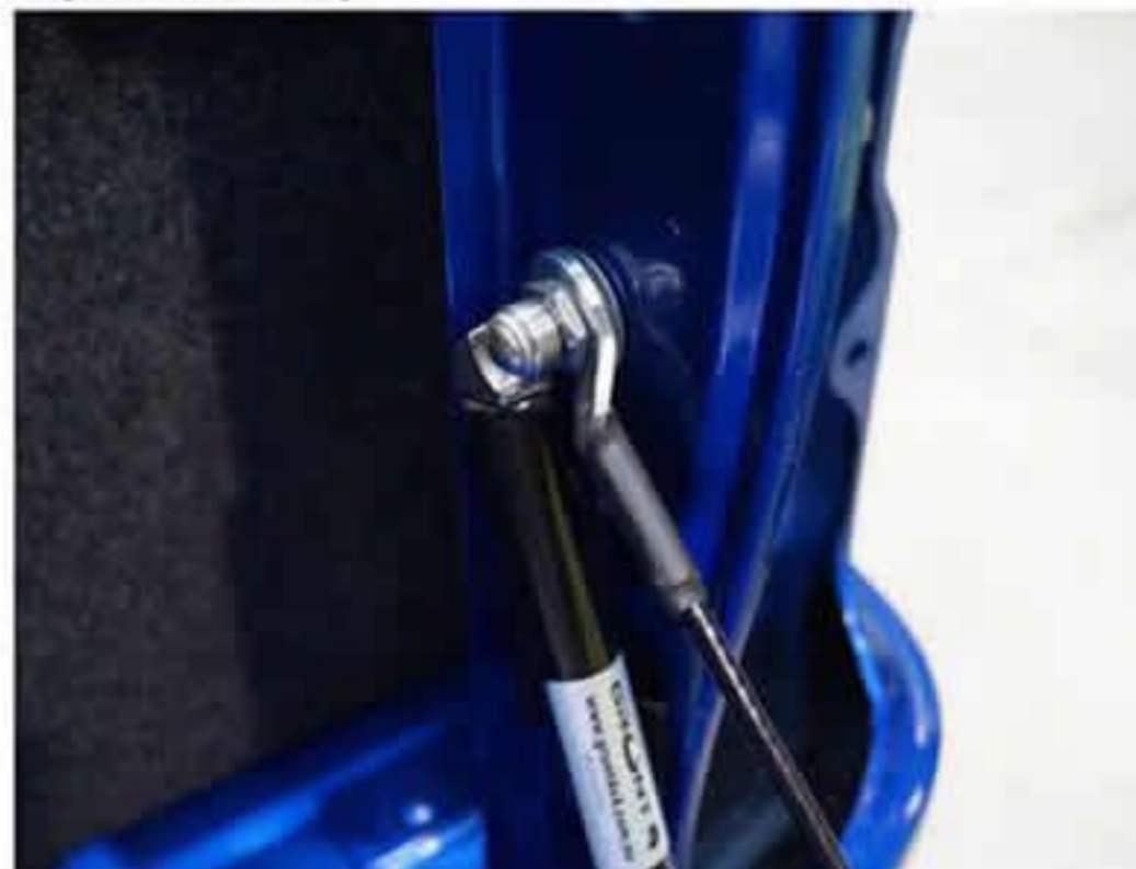
5: Insert the strut & strap through the hole as shown placing the thin washer against the body