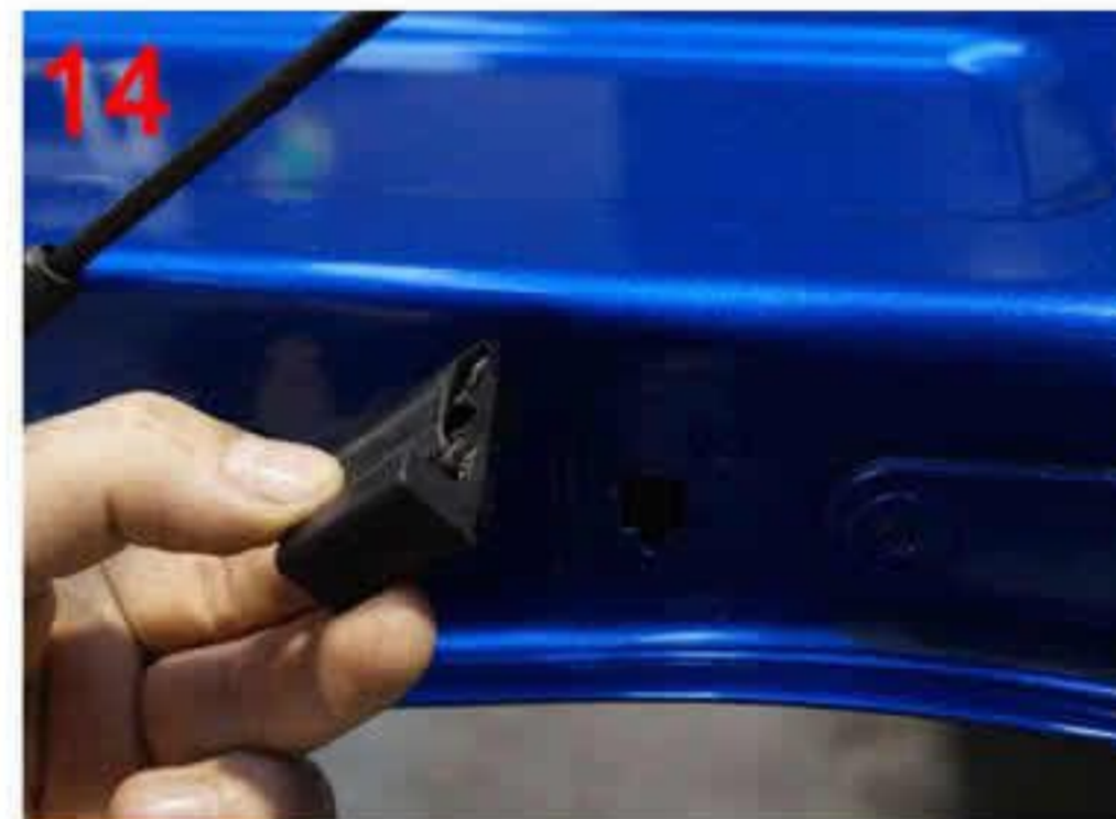
14: Remove the rubber locating blocks from the tailgate and ute tub