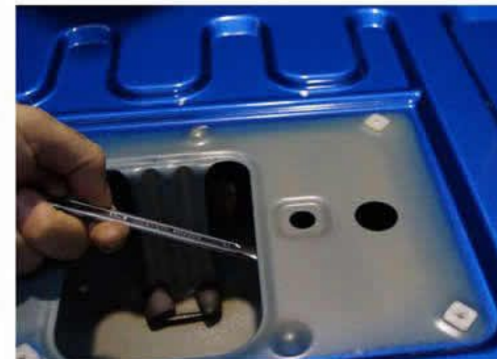
Hold the friction nut inside the tailgate with a 12mm spanner