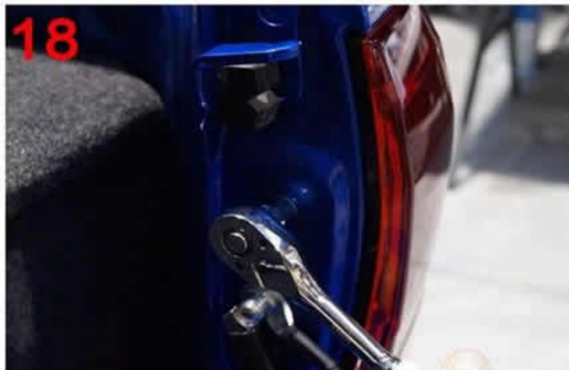
18: Reinstall the taillight