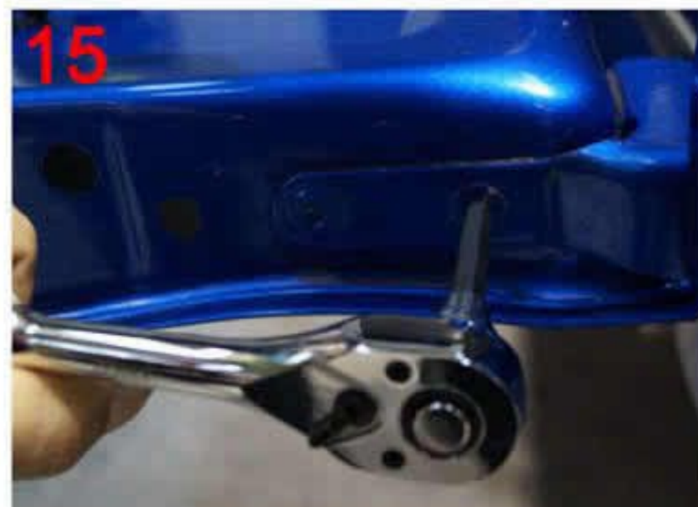
15: Remove the tailgate hinge bolt closest to the body *see notes on page 4