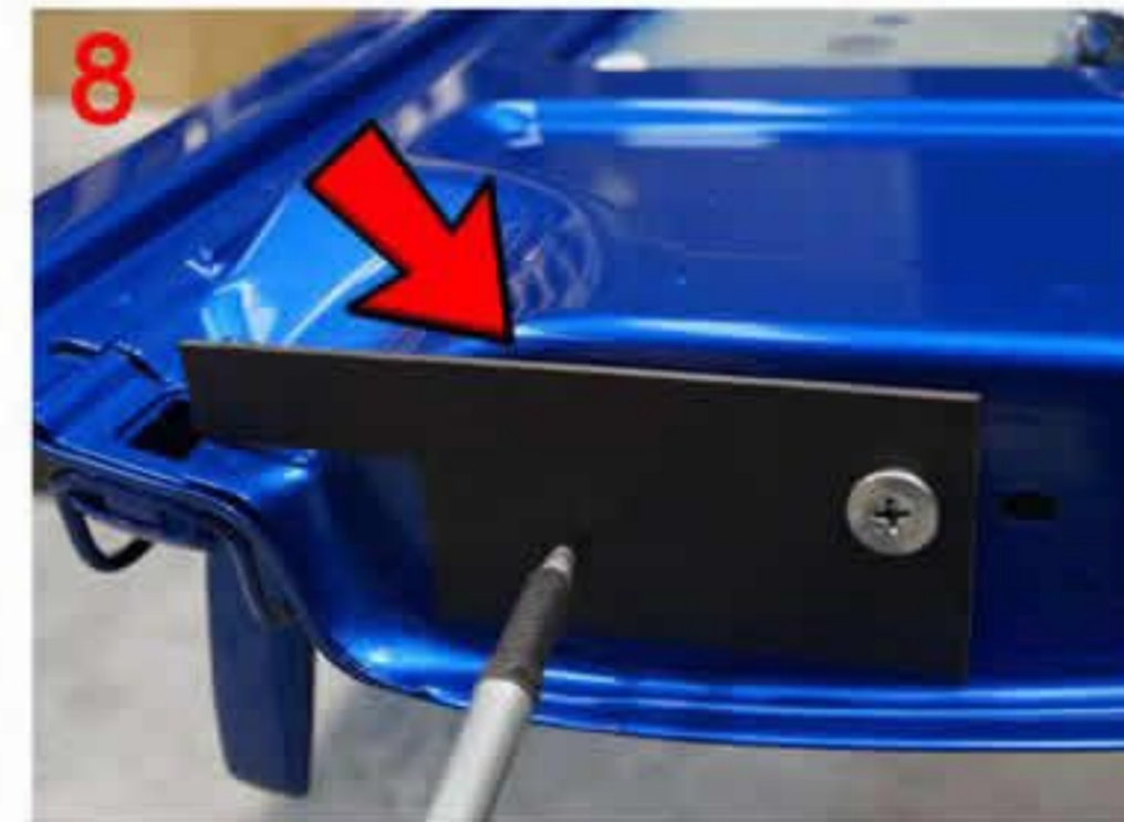
8: Bolt on the template as shown and mark the tailgate