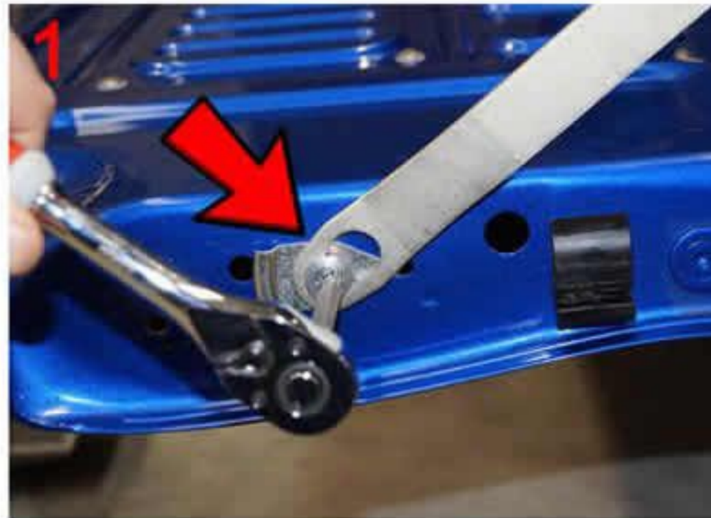
1: Remove tailgate strap bolt *see page 5

INSTALLATION INSTRUCTIONS TOYOTA HILUX SLOW DOWN EASY UP STRUTS PART NUMBER: GUDSTH15