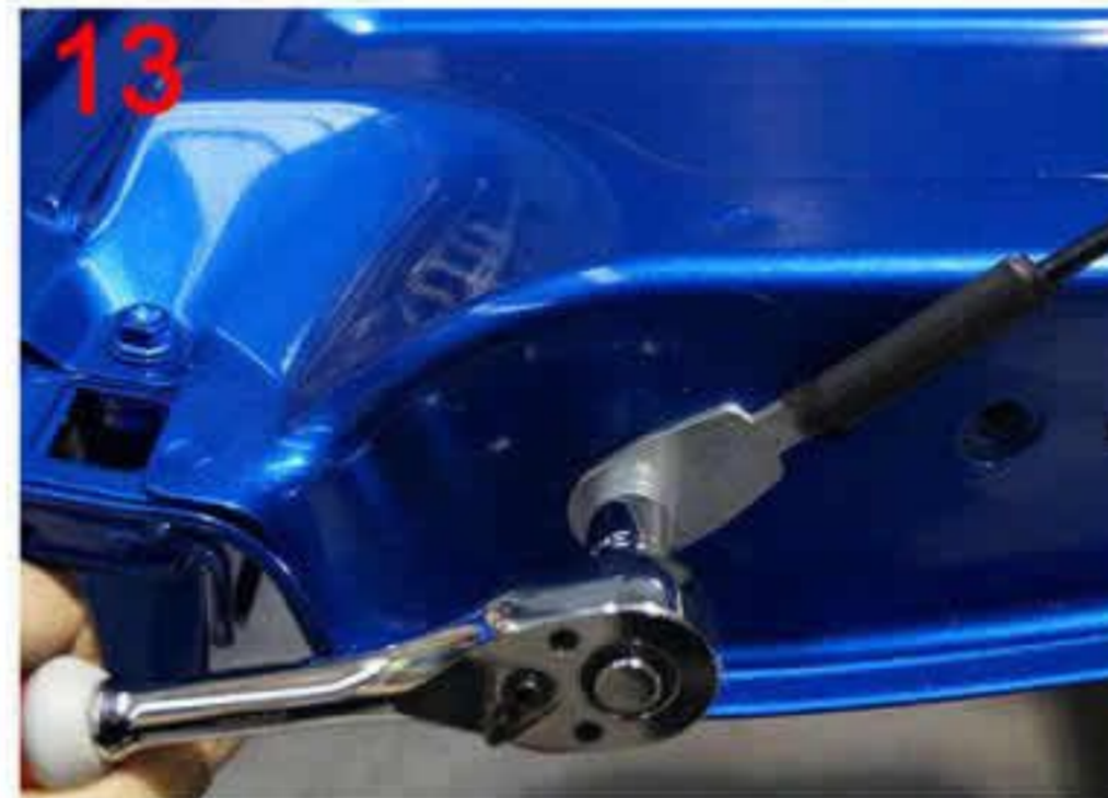
13: Tighten the tailgate strap bolt DO NOT OVERTIGHTEN AS CABLE NEEDS TO MOVE FREELY

INSTALLATION INSTRUCTIONS TOYOTA HILUX SLOW DOWN EASY UP STRUTS PART NUMBER: GUDSTH15