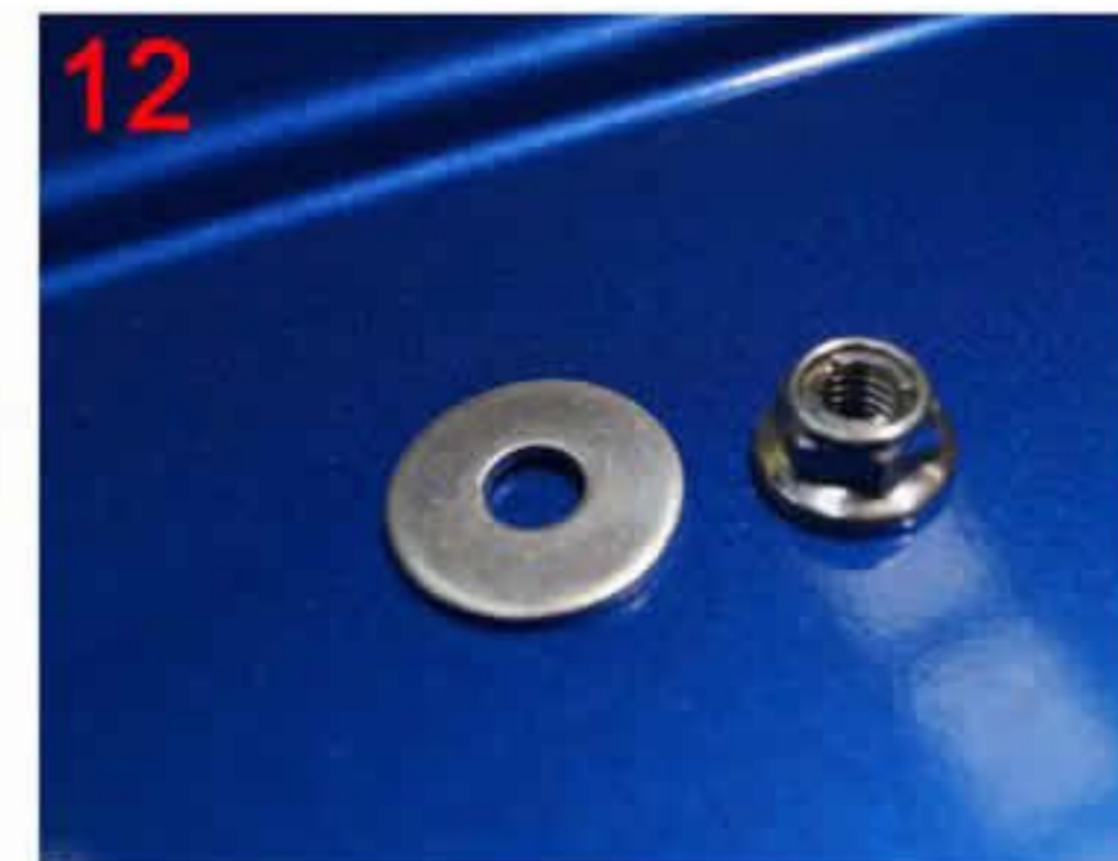
12: Screw the friction nut inside the tailgate placing the thicker on washer on first

THESE INSTRUCTIONS ARE A GUIDE WE ALWAYS RECOMMEND BEING INSTALLED BY A PROFESSIONAL & TAKE NO RESPONSIBILITY FOR DAMAGE CAUSED BY INCORRECT FITMENT OF THE PRODUCT TO YOUR VEHICLE