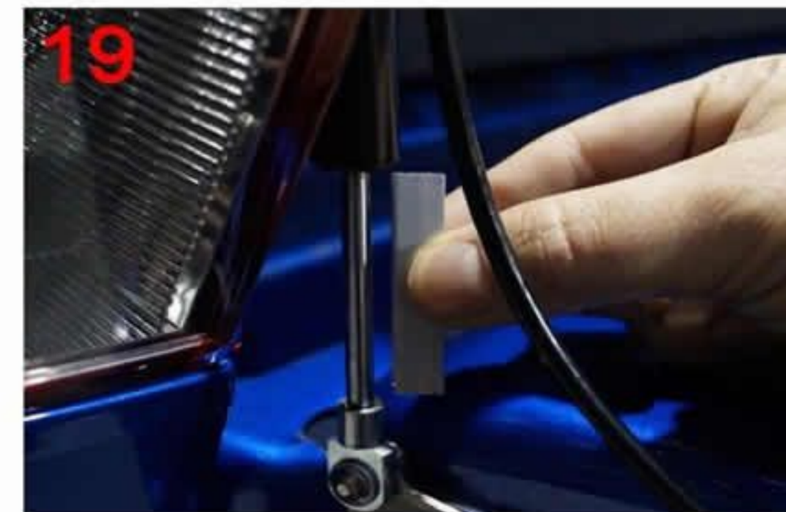
19: Repeat the process on the passenger side for the EASY UP strut removing the spacer once installed

* In some cases these bolts can prove difficult to remove this is why we recommend installation to be completed by a professional