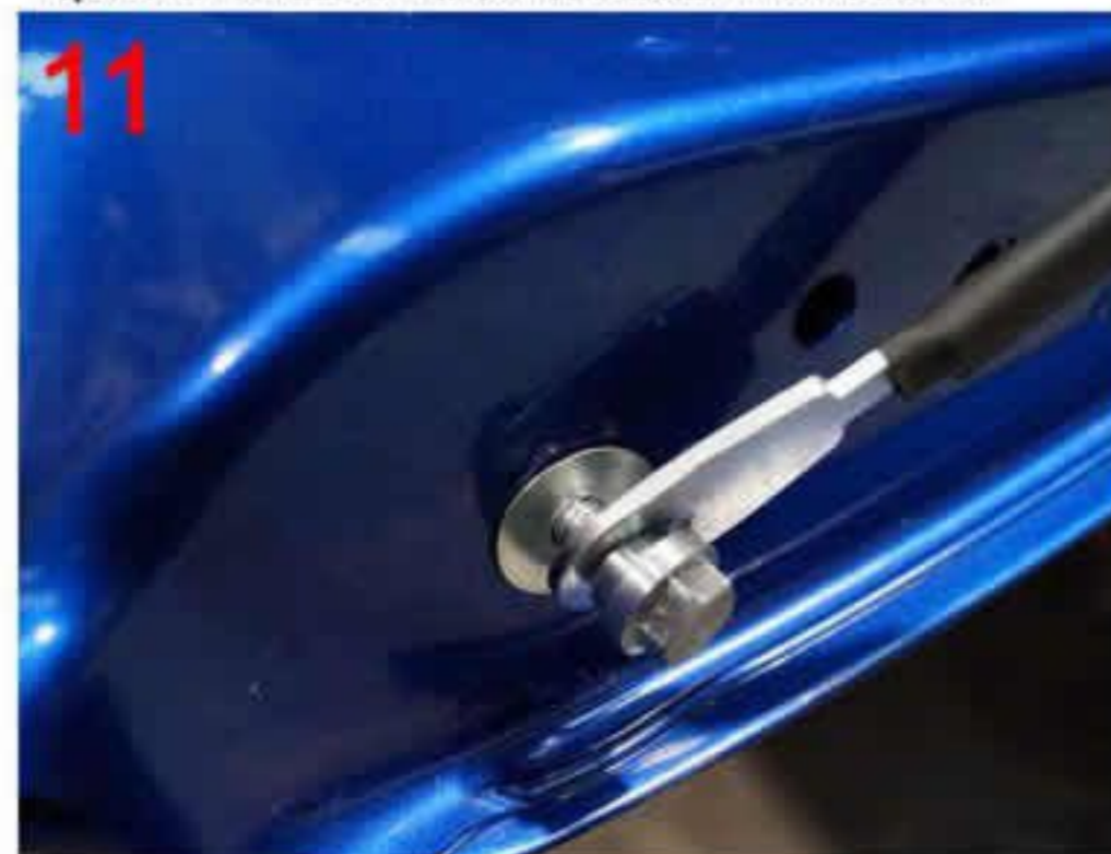
11: Place the bolt supplied through the hole placing the thin washer against the tailgate first