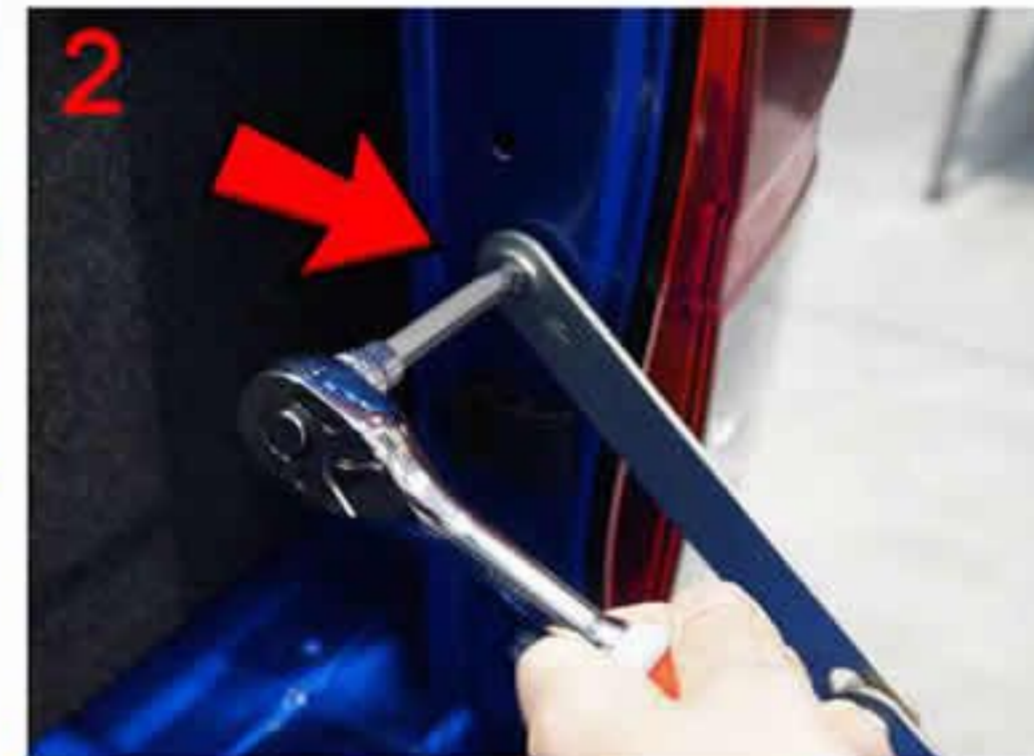
2: Remove body strap bolt *see page 5