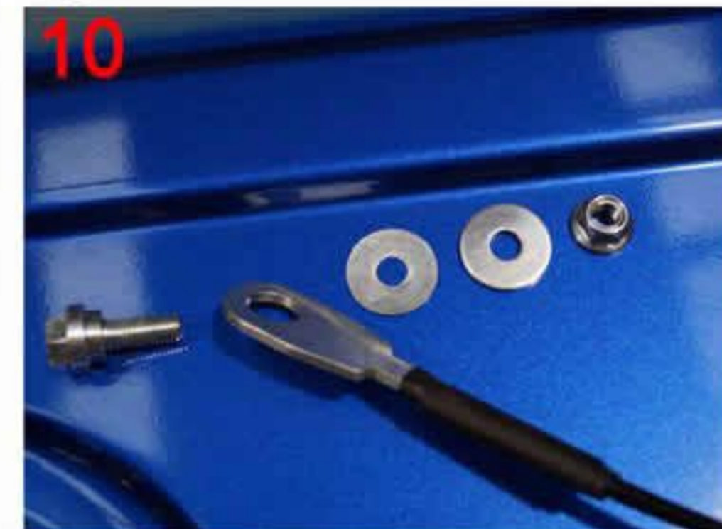
10: Installing the cable to tailgate