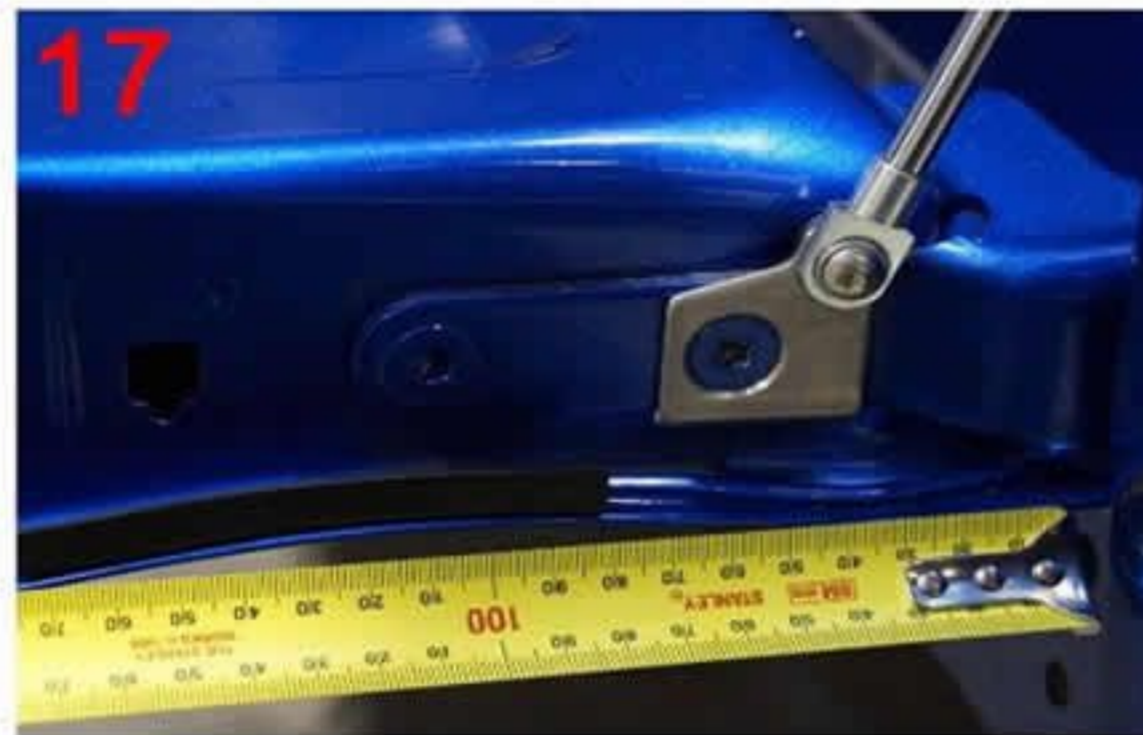
17: Install the cable locating rubber 80mm back from the body as pictured

INSTALLATION INSTRUCTIONS TOYOTA HILUX SLOW DOWN EASY UP STRUTS PART NUMBER: GUDSTH15