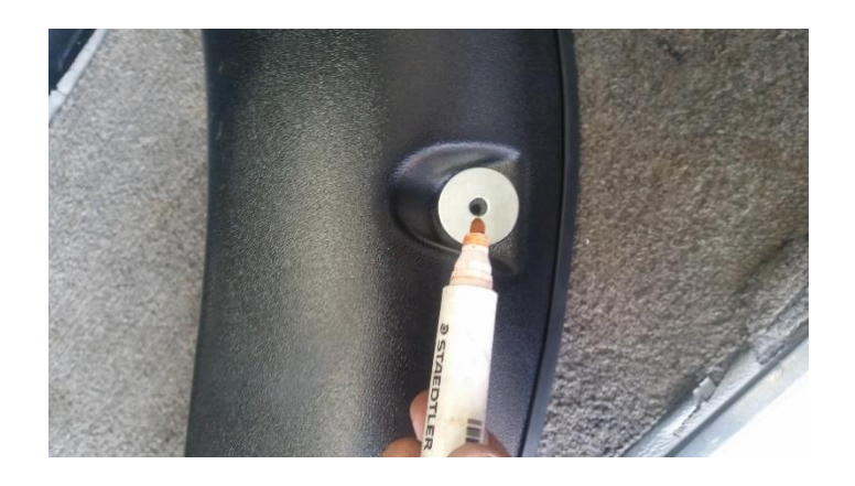
(Figure 1) Using a penny washer can help to find the cente.

Find the center of the bolt notchs in the flare (Figure 1) and pre-drill the holes using a 4mm drill then fit the rubber to the section of the flare that faces the body (Figure 2)