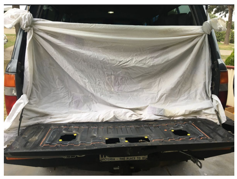
4. Cutting out the inner of the tailgate.

3. Lay out the supplied template, place the bolts into the bolt holes to hold the template down and trace around the inside with a marker or paint pen, then remove it. Before beginning the cut job, we advise covering up the back of your wagon to prevent sharp metal shards from getting it.