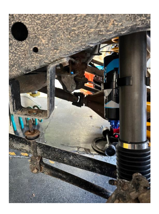
Right side of vehicle from front