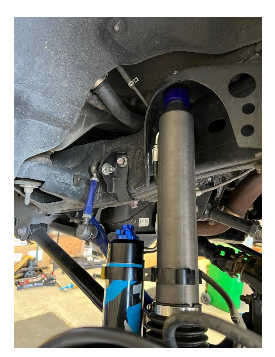
Right side from front.