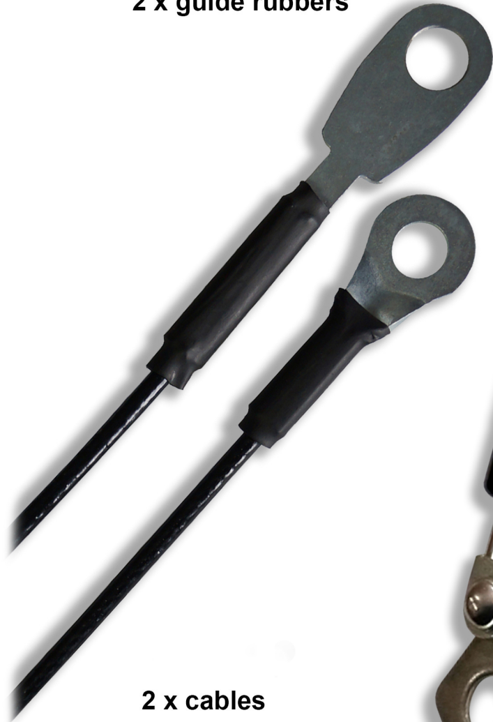
2 x cables