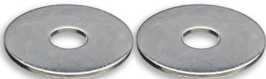
2 x flat washers