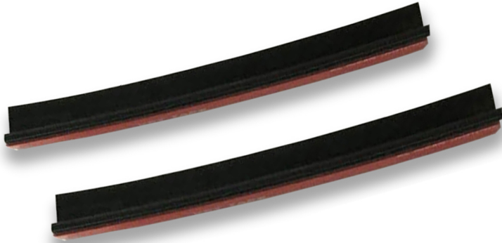
2 x guide rubbers

INSTALLATION INSTRUCTIONS MAZDA BT50 SLOW DOWN EASY UP STRUTS PART NUMBER: GUDS-MBT502