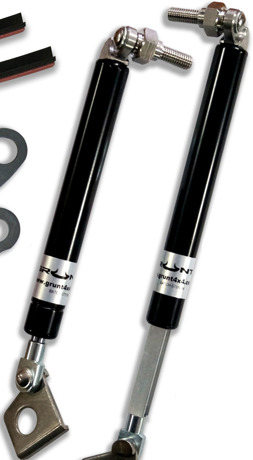
1 x down strut