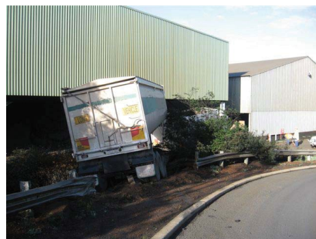
Actual instances of runaway vehicles causing damage to the vehicles and their environments