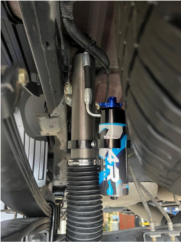
Left side of vehicle from rear