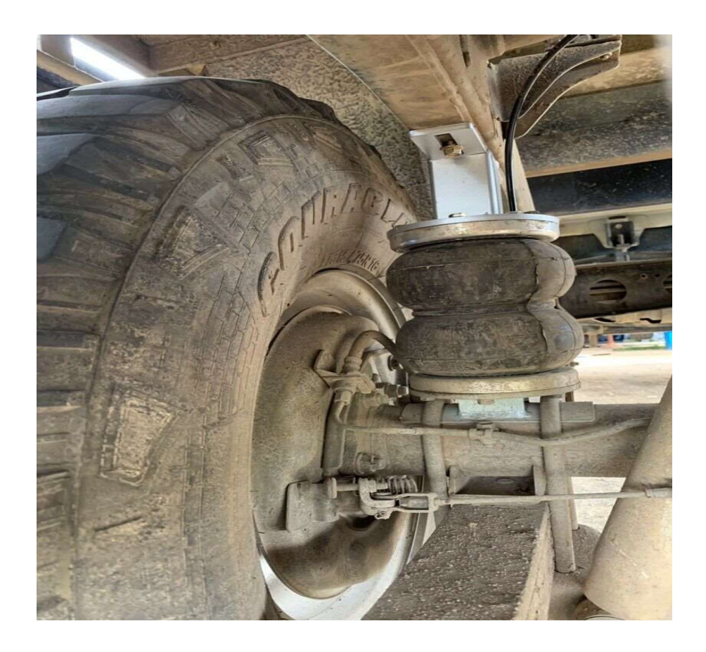
This pic is of a 3" Lifted Landcruiser Ute