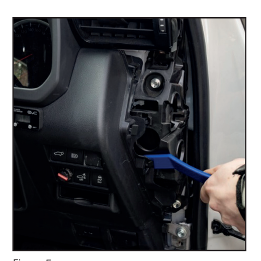
STEP 2. Next, use trim tools to remove the upper knee panel which includes the vehicles factory switches and business card holder. Using Figures 5 to 7 as a guide, work from the bottom of the trim to the top and release this panel. Use caution when panel is released as there are wires connected. Trim is to be pulled directly away from the dash.