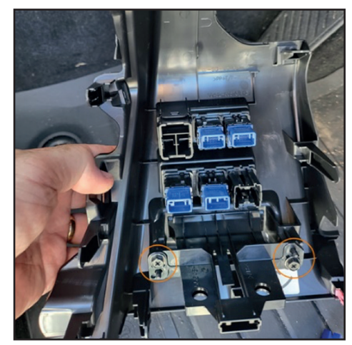
Figure 8 Figure 9