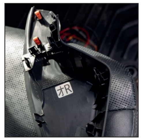
Figure 3 Figure 4