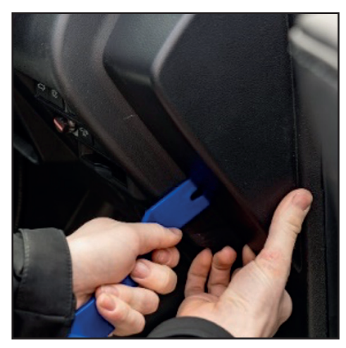
Figure 1 Figure 2