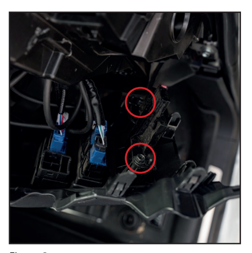
STEP 3. Rotate the removed trim panel to gain access to the 2x screws retaining the business card holder, refer to figure 8 and 9.