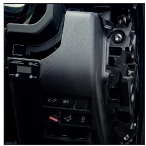
Figure 5 Figure 6