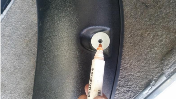
(Figure 1) Using a penny washer can help to find the centre.

Find the center of the bolt notches in the flare (Figure 1) and pre-drill the holes using a 4mm drill then fit the rubber to the section of the flare that faces the body (Figure 2)