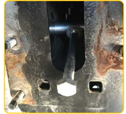
Pic 6. A brake away view of the M12x140 bolt in from the front of the chassis. This is missing the front chassis plate for illustration purposes.