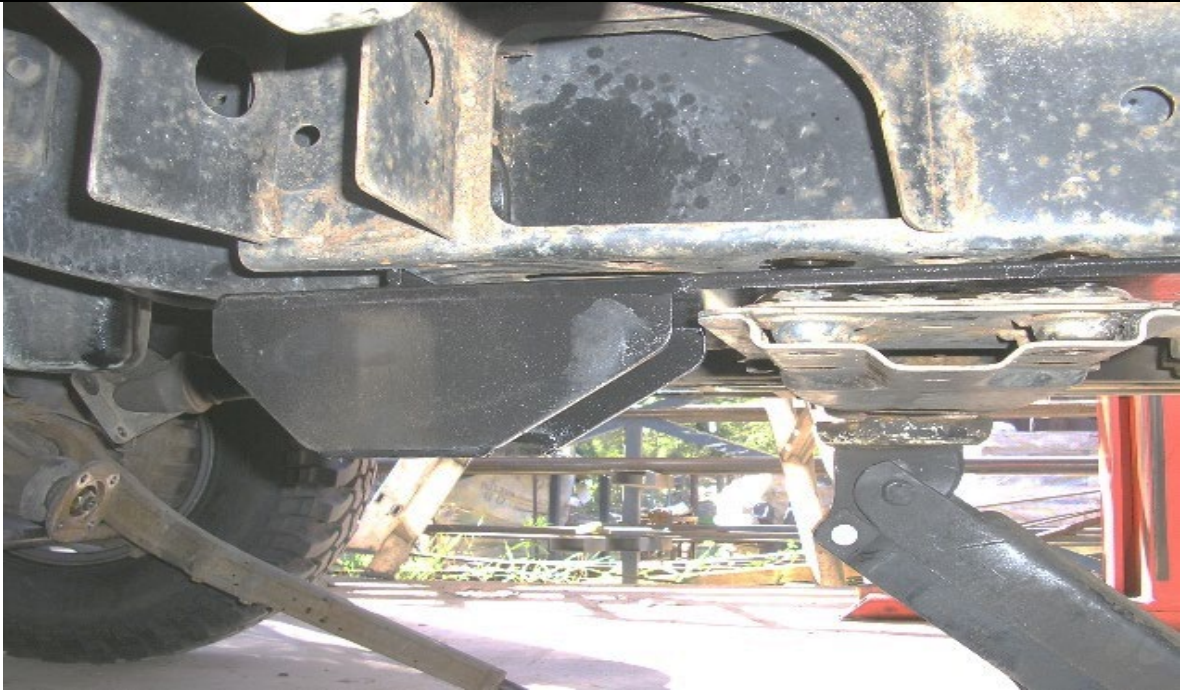
FIGURE 1: FITTING OF THE DROP BOX