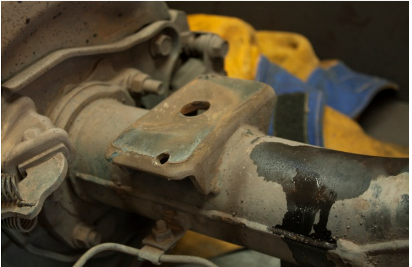
Figure 1: Damaged Factory Diff Perch