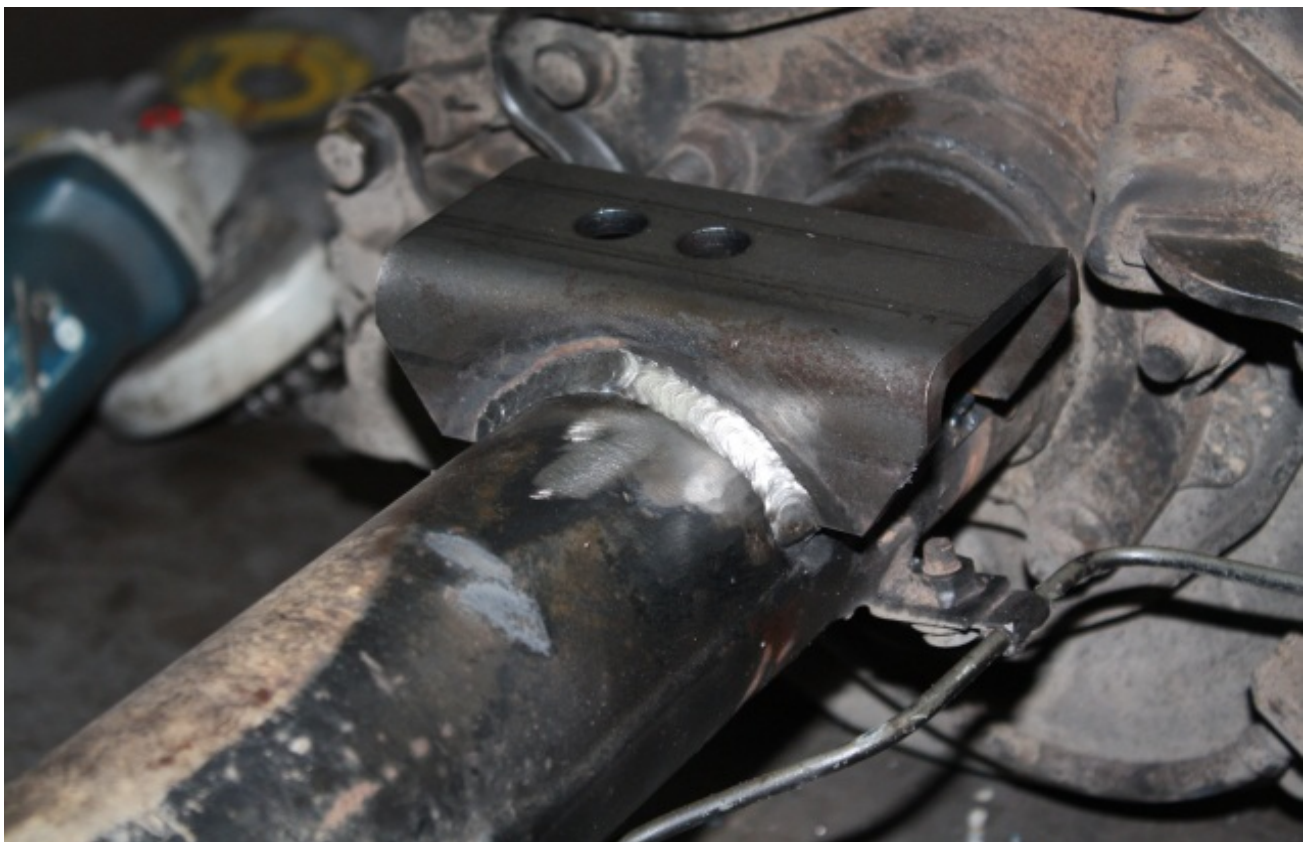
Figure 2 : Correctly Welded Diff Perch