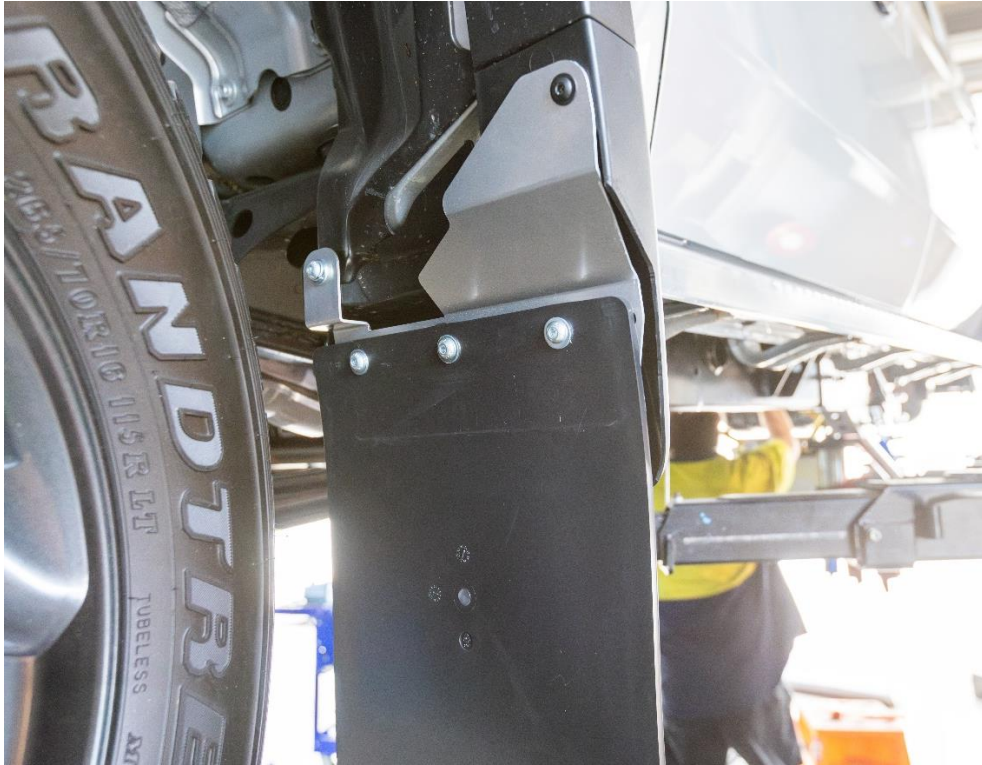
FIGURE 4: Mudflap and Bracket correctly fitted. (Note that the mudflap can slide toward the outside of the vehicle to allow for larger offset wheels).