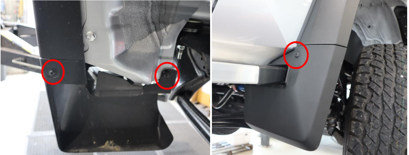
FIGURE 1 & 2: Factory Fastener Locations