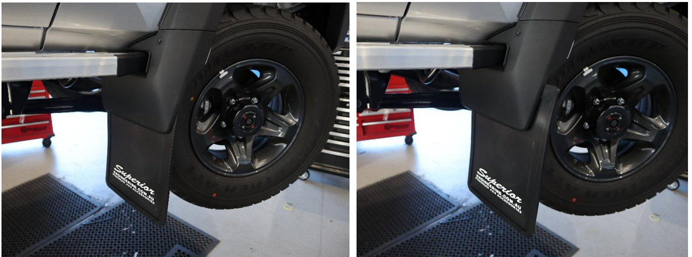
FIGURE 5 & 6: Mudflap fitted with no offset, and fitted with maximum offset.