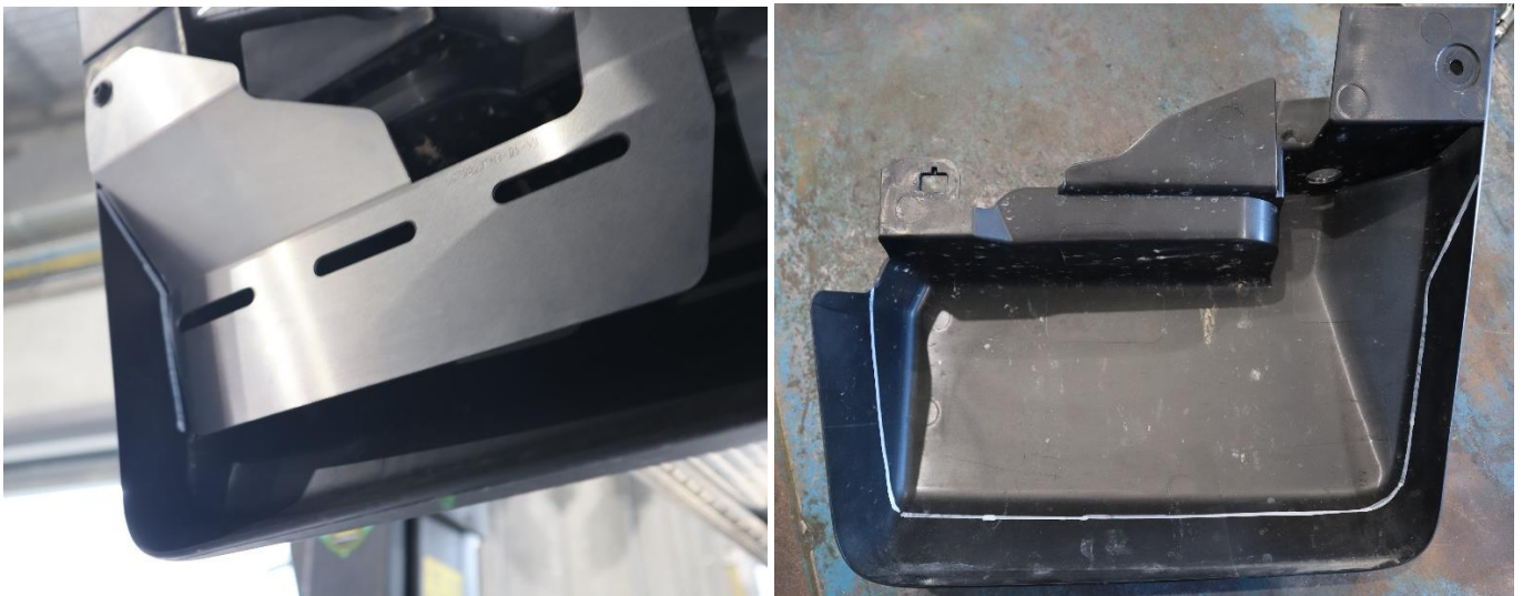
FIGURE 3 & 4: Bracket fitted to the mudflap, and the line marked ready to cut.