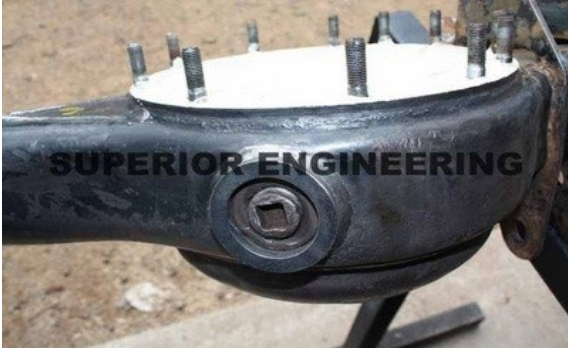
FIGURE 4: DIFF DRAIN PLUG RING