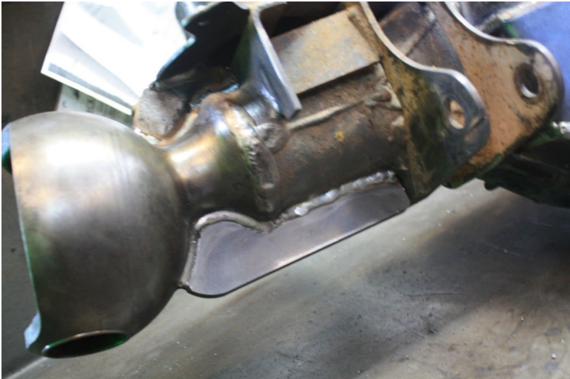
FIGURE 3: KNUCKLE BRACES FITTED