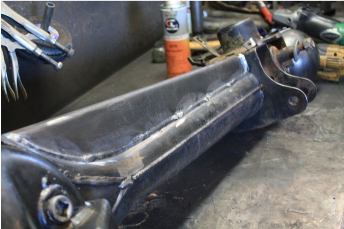
FIGURE 2: TOP BRACE WELDED ON IN SECTIONS