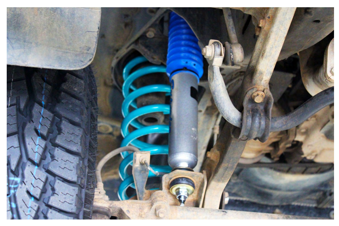
Figure 2: Nitro Gas Pin Style Fitted