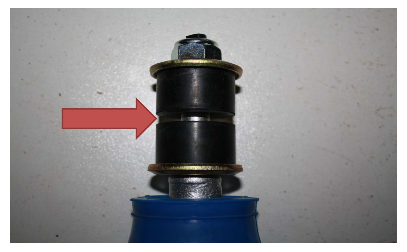
Figure 1: Correctly Fitted Bush Assembly