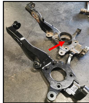
Figure 7: Remove OE axle seal from OE and install on new Steering Knuckle