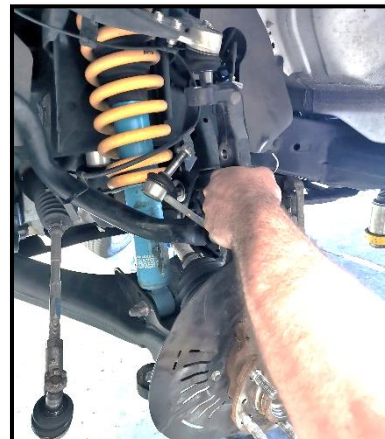
Figure 5: Remove OE steering knuckle from the vehicle