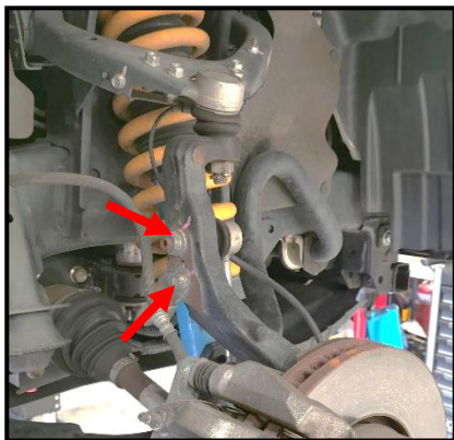
Figure 1: Remove brake line bracket & Swaybar Link