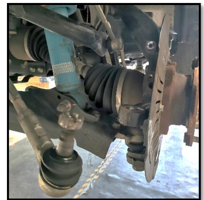
Figure 3: Remove Tie Rod Outer Joint