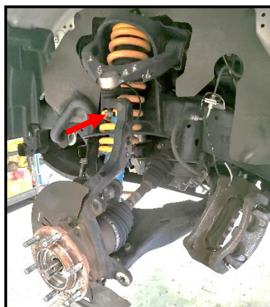
Figure 4: Loosen nut but do not remove, this will keep the steering knuckle from falling.