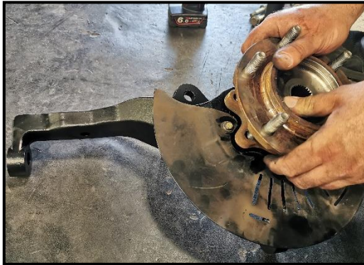
Figure 6: Remove wheel bearing hub assembly & dust shield