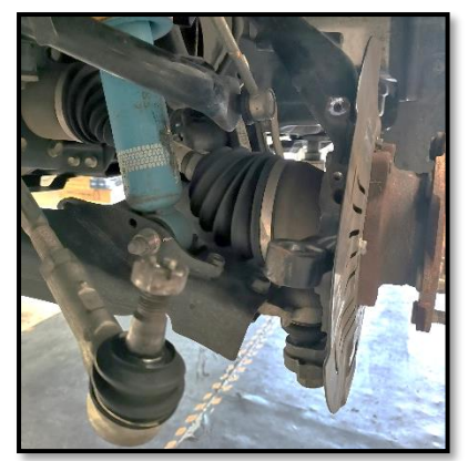
Figure 3: Remove Tie Rod Outer Joint