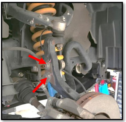
Figure 1: Remove brake line bracket & Swaybar Link