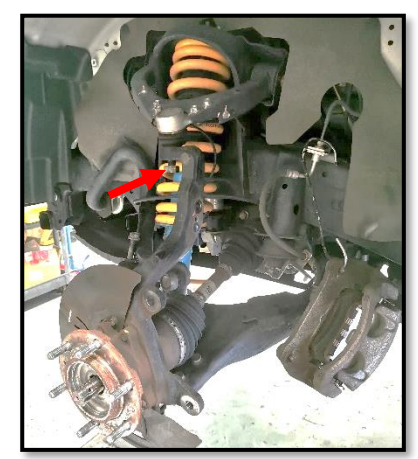
Figure 4: Loosen nut but do not remove, this will keep the steering knuckle from falling.