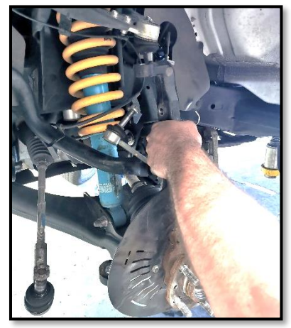
Figure 5: Remove OE steering knuckle from the vehicle