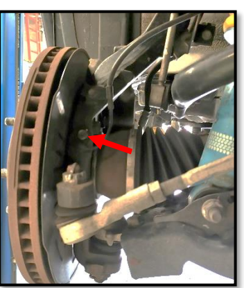
Figure 2: Remove ABS Wiring