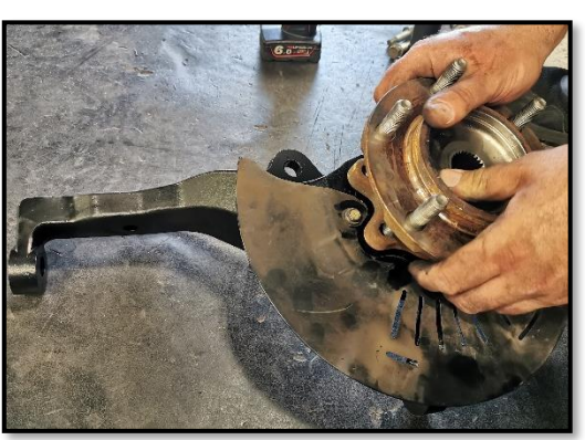
Figure 6: Remove wheel bearing hub assembly & dust shield