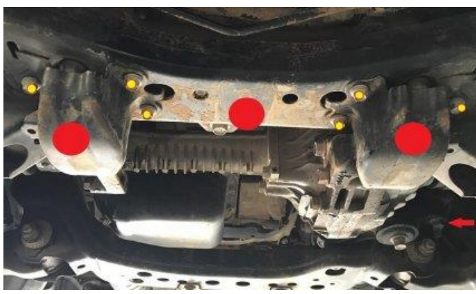
Red dot indicates the larger main diff drop spacers and bash plate mount, inc. new bolts. Yellow dots are the small spacers with new bolts. Red arrow locates the 6mm spacer.