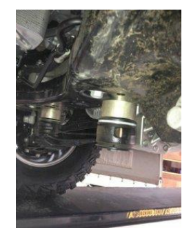
Shows Two Main Spacers Installed from rear view

Suitable for Landcruiser 200 Series. De-signed to allow for the front diff to be lowered by 25mm, thus reducing the angles CV Joints need to operate on. Suitable for vehicles with KDSS and 2016 models.