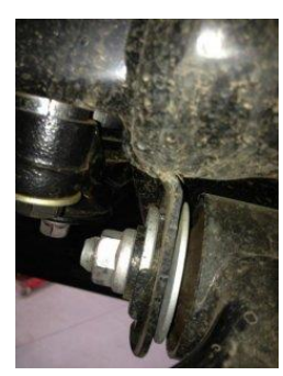
6mm spacer installed into diff mount under passenger side of vehicle (side view)