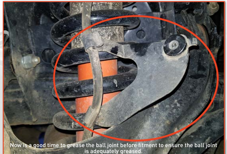
Now is a good time to grease the ball joint before fitment to ensure the ball joint is adequately greased.