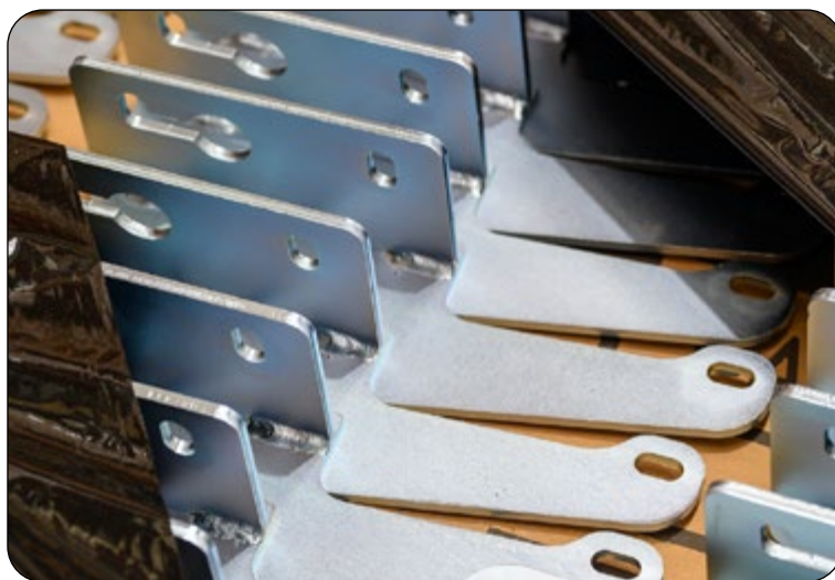
Generic image shown

For added durability and aesthetic appeal, zinc-plated bars are powder-coated. This finish enhances the bar's resistance to wear and tear while providing an extra layer of corrosion protection.