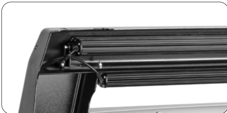
Generic image shown

The Ti nudge bar integrates a 30-inch LED Light Bar into the top channel.