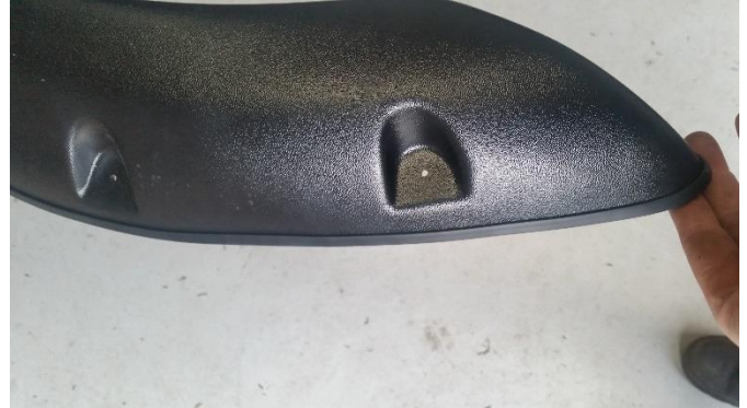
(Figure 1) Using a penny washer can help to find the

Starting with the front of the car (I always do the side with a snorkel first) offer the flare up against the guard.