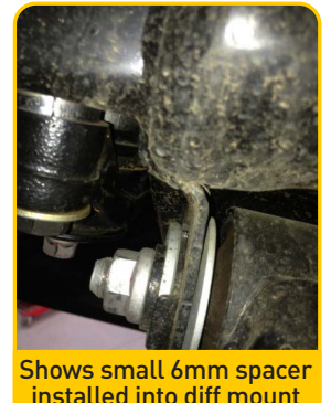
Shows small 6mm spacer installed into diff mount under passenger side of vehicle (side view)