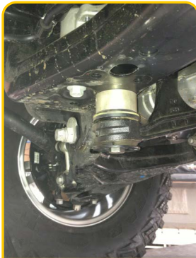
Close up of driver side main spacer