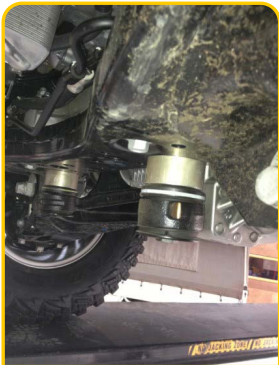
Shows two main spacers installed from rear view

Suitable for Landcruiser 200 Series. Designed to allow for the front diff to be lowered by 25mm, thus reducing the angles CV joints need to operate on. Suitable for vehicles with KDSS and 2016 models.