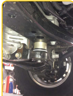
Close up of passenger side main spacer