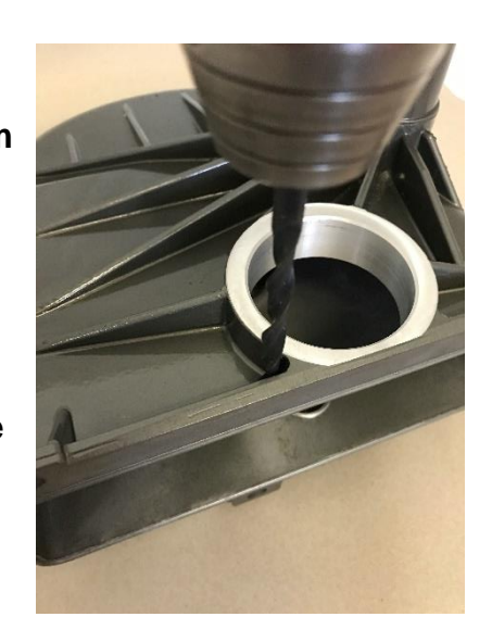
Step 1: Fitting the Angular shim Using a 6.5mm drill bit, place the drill tight into the corner of the casting and, without drilling through the case, create an indent, the centre of which will be your guide for the smaller drill bits. Repeat this on the other side of the main aperture.

To begin, remove the top housing from your winch and set aside. Disassemble your lower housing into its component parts and clean all components thoroughly. Providing the mainshaft needle roller bearing is in good condition, this should be left in place, cleaned & lubricated.